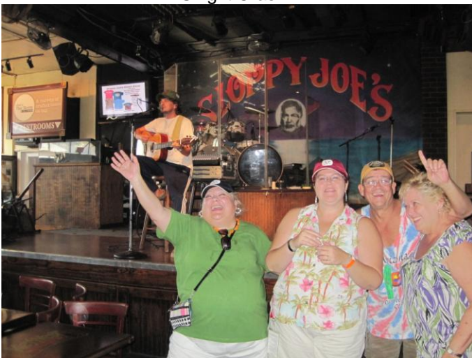
Too much fun...