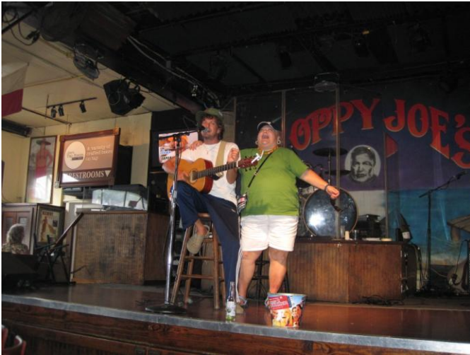
Sing it Crash!