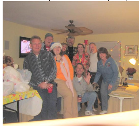
Last Parrotheads standing