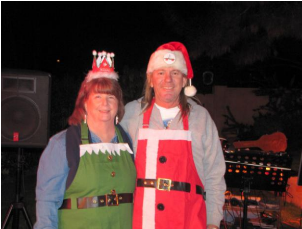
St. Jello Shot Queen and Goat-your hosts