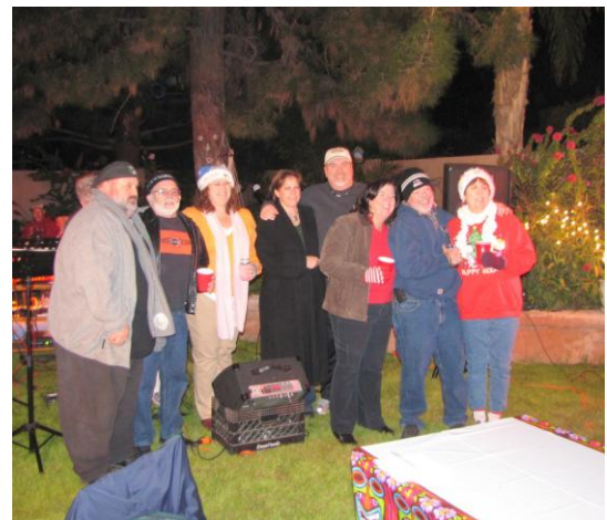
2010 BOD (Crash is not in the photo)