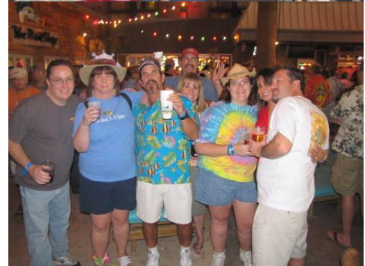
A good time!