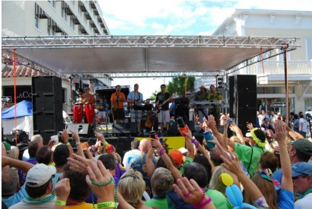
Phins to the Left!