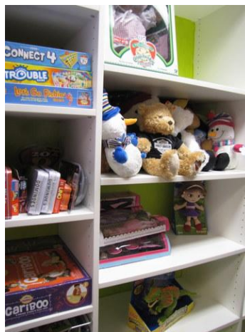
The kids love it!