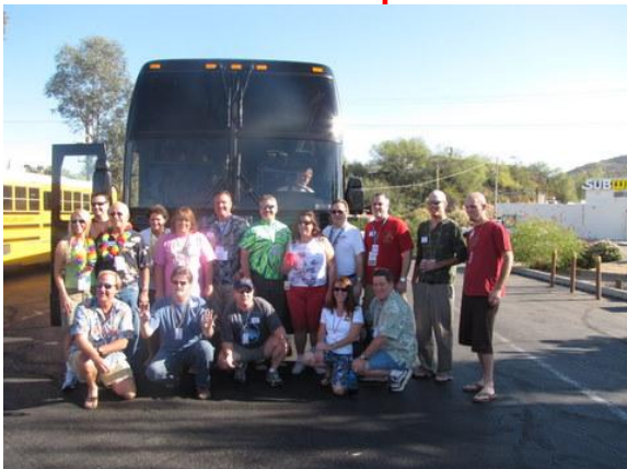
2008 Jello Shot Express Virgins