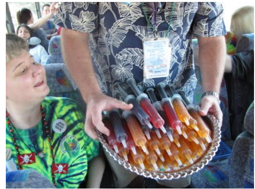
How handy, jello in a syringe!