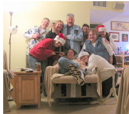
The last Parrotheads standing! Or sitting.....