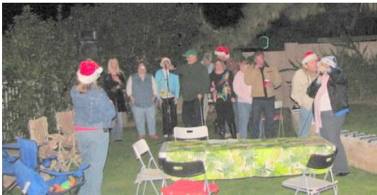
Joke contest contestants