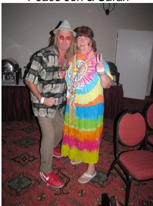
Goat & Queen