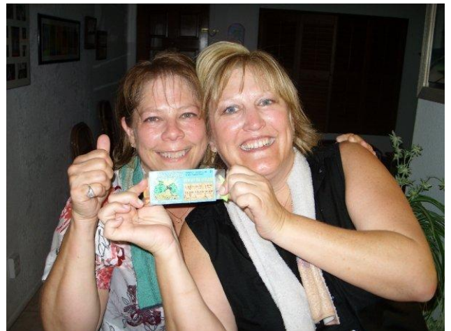
The winning $10,000 ticket...not!