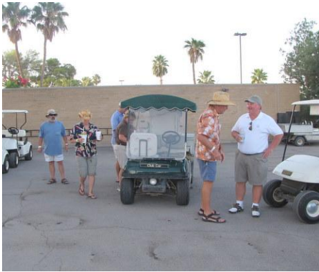
Ahhh, the beverage cart!