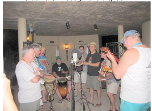
8 th floor jam session