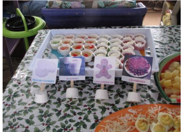
Jello Shot Prince's creations-yum!