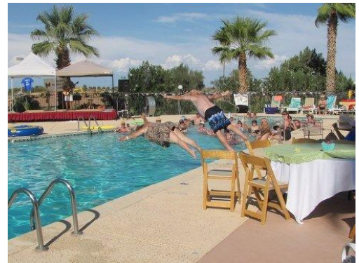
Crash & Crimedog make a splash!