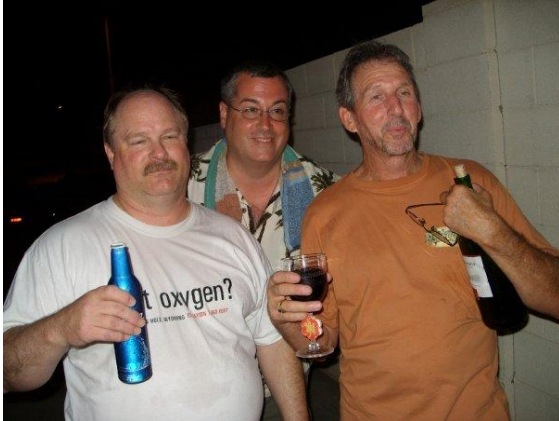
There was also a phenomenon at the party never before seen in one place: 3 Steves!

Thanks to everyone that came out – we're looking forward next year already!