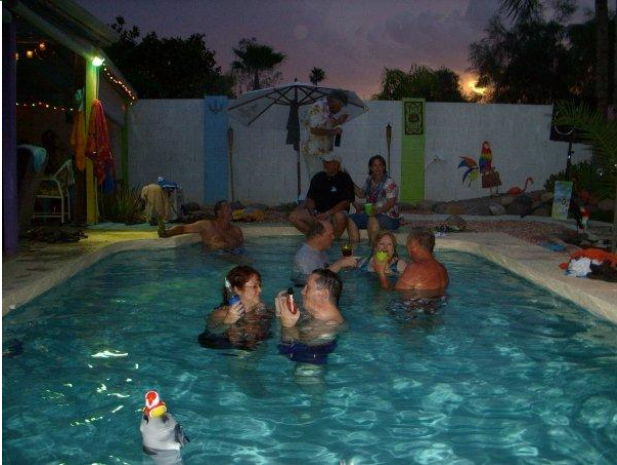
Nice sunset was provided also!