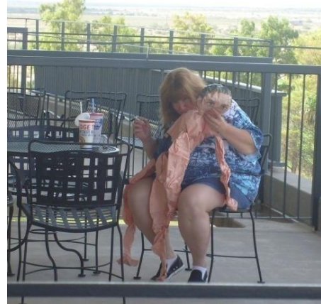
A picture says 1000 words...