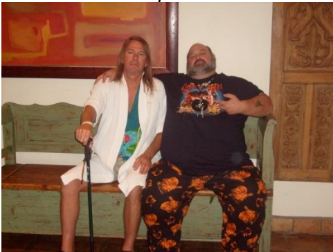
Goat & Wastnawa