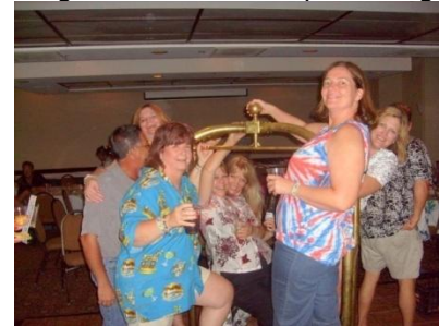
It's midnight and we are fearless!