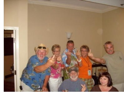
This one's for you Goat!