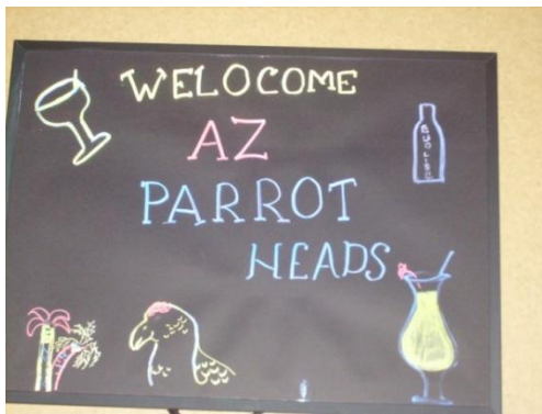
Typical Parrothead sign!