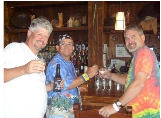
Sunday afternoon-Here's to you....