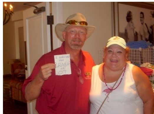
This guy survived the 'Crash of 2007'!