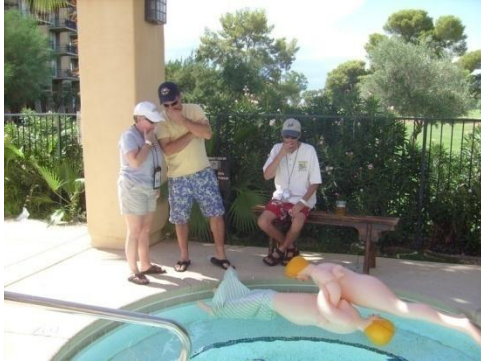
This is a mystery to Parrotheads??