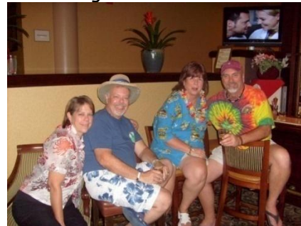
The last Parrotheads standing/sitting....