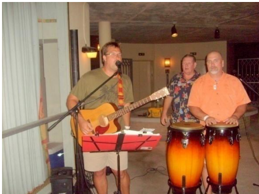
8 th Floor party