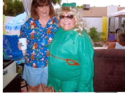
St. JSQ with the evil elf!