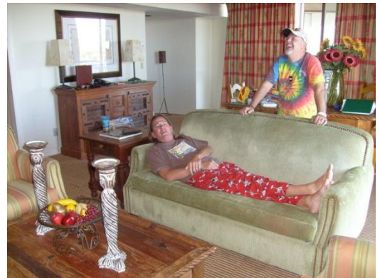
Goat's on the couch, PG must be over.....