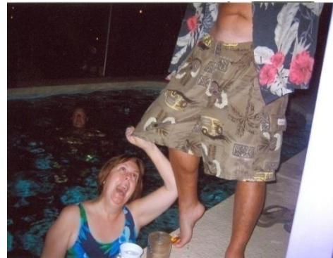
There's one in every crowd!